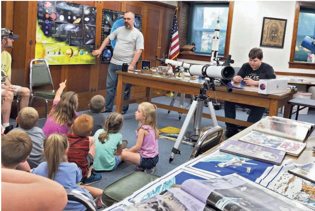
The six branches of Branch District Library hold about 1,000 events each year, for a wide range of ages.