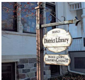
The Coldwater branch of Branch District Library is one of six in the county.

The millage covers almost 90 percent of the district library funding. The remainder comes from fines levied by the